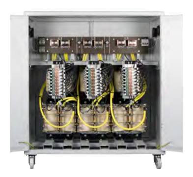
Internal view of the iVolt