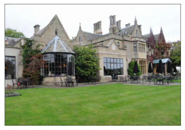
Foxhills Hotel and resort

"The savings are three-fold really," added Ben. "The iVolt® not only saves us money by reducing the amount of power we use but it reduces the strain on equipment, which means it lasts longer, and by monitoring our energy consumption in real time it provides me with crucial information which I can then take to my staff to make them more conscious of the electricity we're using - and in many cases wasting. This tool was really the reason we chose iVolt® over its competitors and we're very happy with the results we're seeing."