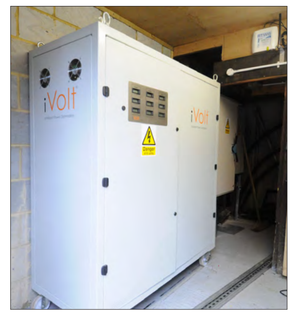
The iVolt installed on site

"The iVolt<sup>®</sup> not only saves us money by reducing the amount of power we use but it reduces the strain on equipment ... and by monitoring our energy consumption in real time it helps make staff more conscious of the electricity we're using - and in many cases wasting."